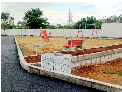
Actual site photos

SM EMERALD AVENUE is a truly valuable and once-in-a lifetime investment for your home.